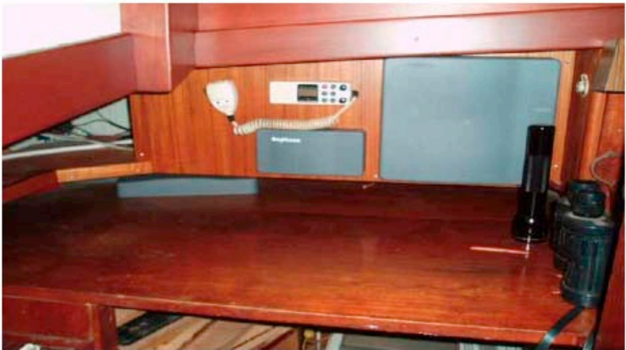
Navigation station located opposite cabin above. There is a bunk just forward of this position. Horizon Eclipse VHF, another GPS and controlling radar display with covers on. 4 full size chart shelves under desk, book stowages on left.