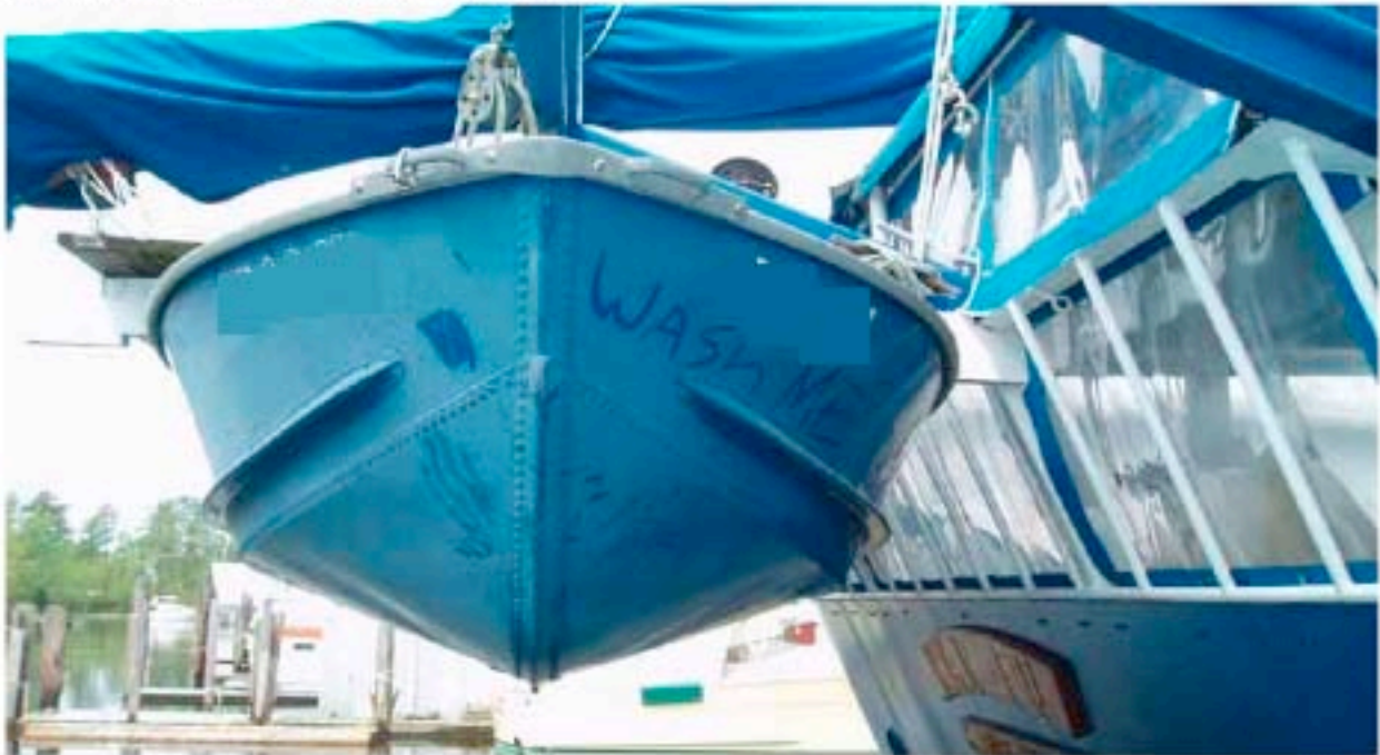
14 ft dinghy stowage. Turnbuckles on slings haul dinghy up hard against beams which are slotted to take dinghy gunwhale. In 10 gales the dinghy got its bottom wet twice. About 8 feet off water. It is being washed!!!!