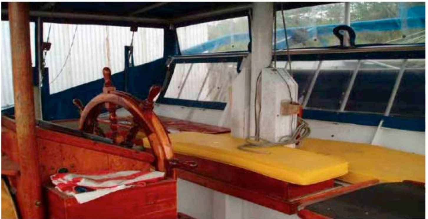
Helm and stern seating. Fully enclosed with watertight awning. 2 tables, see part of port one, with additional seats port and starboard. Can seat at least 12 people or helmsman and two sleeping beauties!!!!