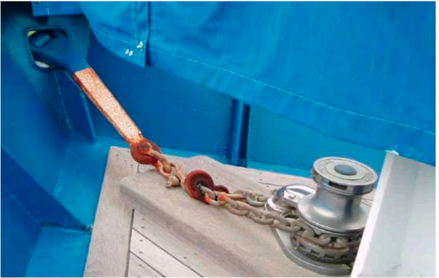
Anchor Windlass with chain hook stopper.