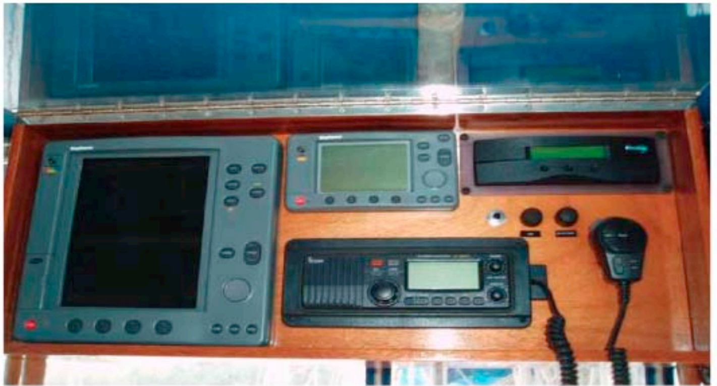
Instruments above helm. Lockable lexan cover. L to R. Raytheon RL80C radar/plotter. Raytheon RN300 GPS, GyroTrac compass. Horn buttons ICOM M-127 VHF