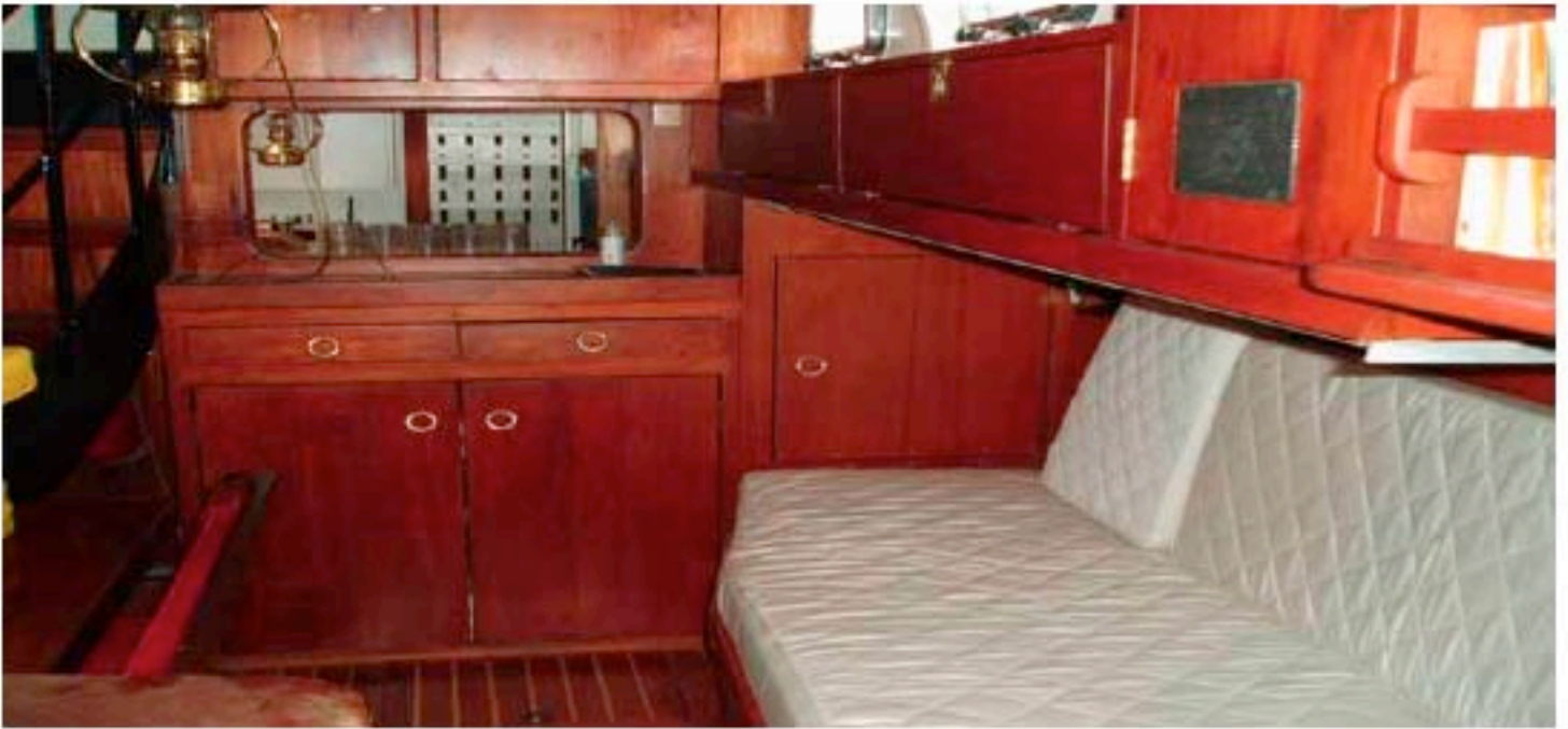
Main cabin port aft.

Pass-through from galley, sideboard, bunk with drawers below, bedding cupboard at foot of bunk. Each of the 4 bunks in main cabin have drawers/stowage below with bedding cupboards at head or foot. Cupboards or bookcases above