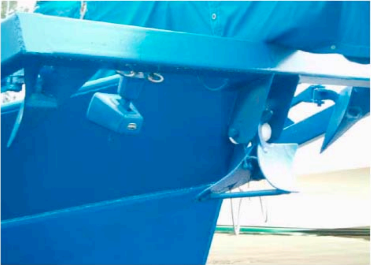
Bow shot showing "bull bar", 145lb CQR in roller chock. 45lb and 65lb CQRs in stowages in corner of bullbar. Remote controlled spotlight in folded down position