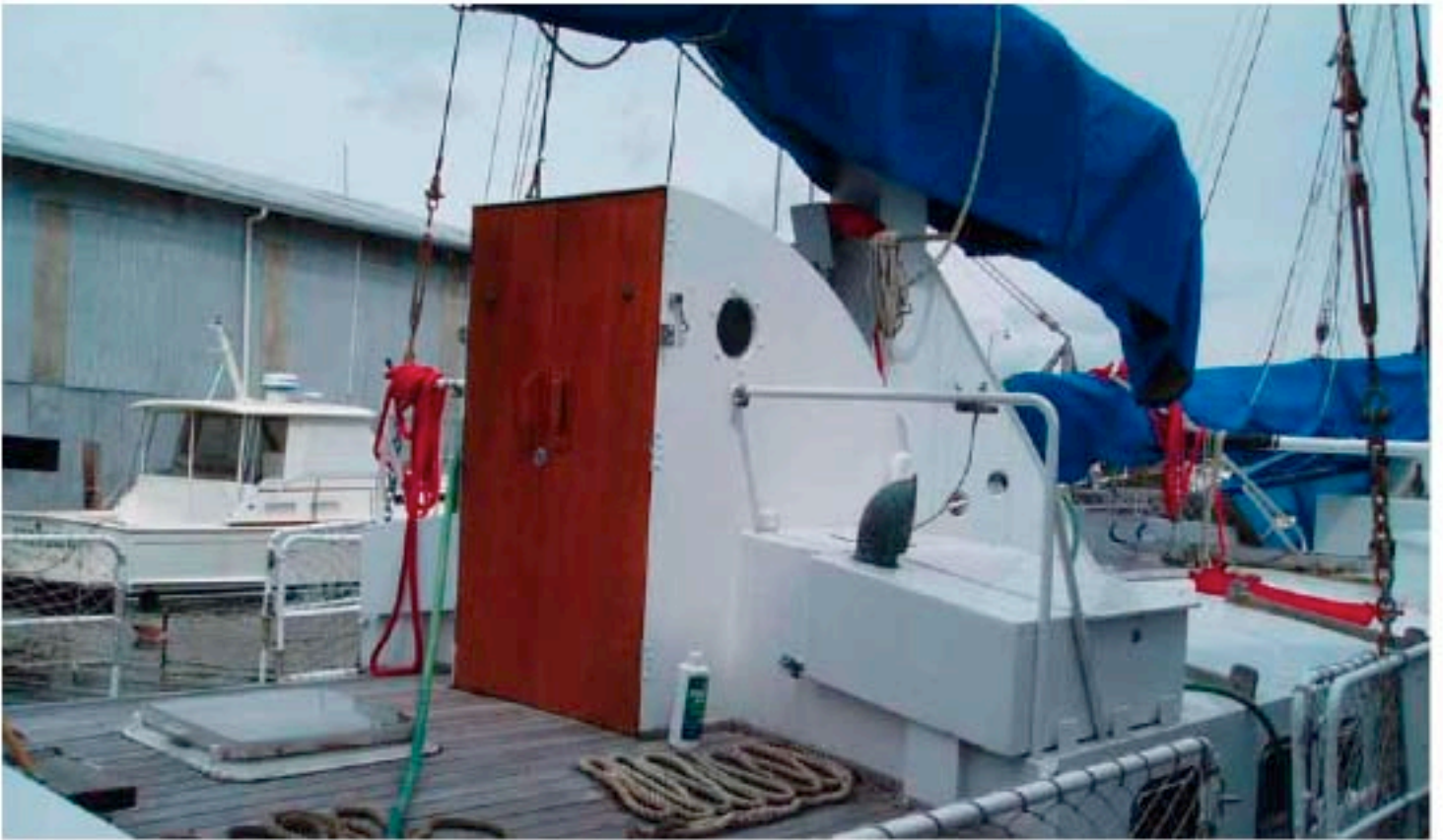
Companionway to main cabin. Stbd side tank is for lube oil, deck box outboard. Port side tank is water fill tank, deck box outboard. Galley skylight.