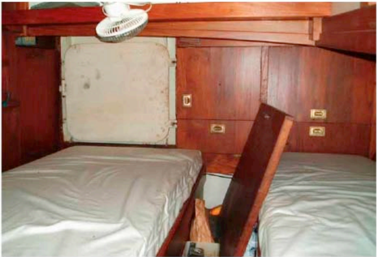
Stern cabin showing entrance to lazarette. Lefthand bunk can be moved against other to form a double bunk. Drawers and stowages under bunks. Hanging cupboard forward end of cabin.