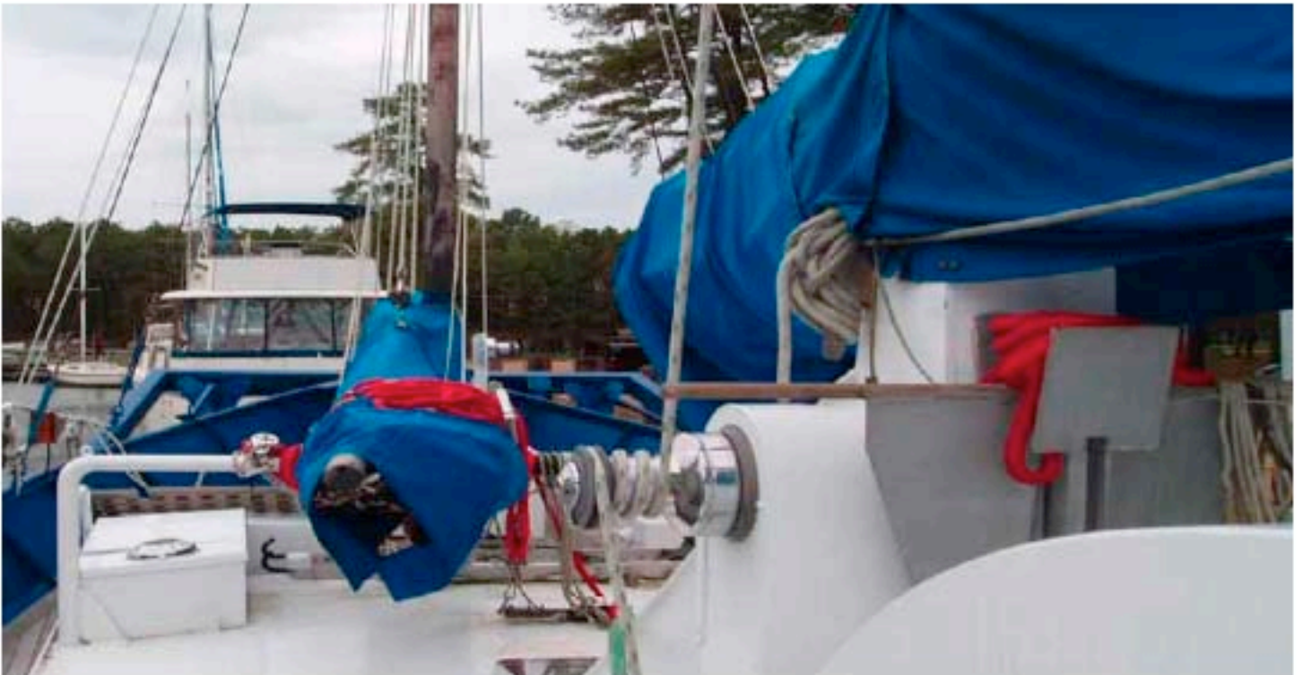
Main halyard electric self-tailing winch. Note Danforth anchor stowage.