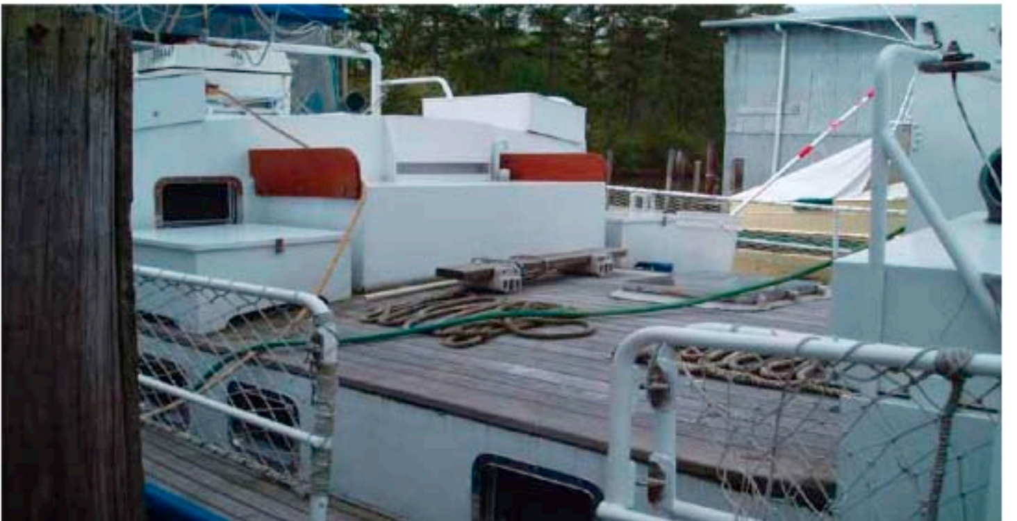
Aft view of center deck, seat in center and line boxes either side. There is also a line stowage in the seat. Windows are to the two heads and the stern cabin. Gate(stbd & port) is for boarding. has brackets for gangway.